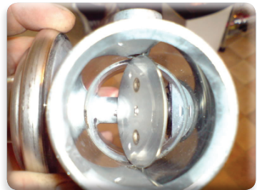
EGR valve after cleaning.

BTN Turbo supplies brand new replacement turbochargers, made by the original manufacturers to the highest quality standards. Though we confidently guarantee them, our standard warranty does not cover turbocharger failure caused by external engine faults.